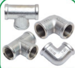
Stainless Steel Pipe Fittings