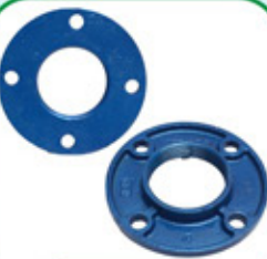
Ductile Iron Plange