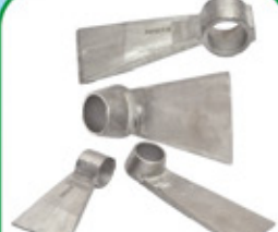
Stainless Steel Axe & Picks

Since 1991, RISHI CAST PVT. LTD. as a Manufacturer and Exporters of Widest range of Casting Products and Progresses which inclnote Grey Cast Iron, Ductile Iron / S.G. Iron Green sand Casting, Cell Moulding Casting, Investment Saring / lost ware precision Casting etc. Company make a wides range of, Manhole Cover, Garage Jali, C.I. Gratings, Poraeket for Basin and WC, Foot Step & Cascode chair braekets, Coupling, Flange, Borecape etc. are made by Special Graded / Ductile from Casting Proces. for Making products durable and Unbreakable under "RISHI" Brand.