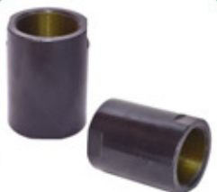
Ductile Iron Coupling