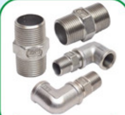
Stainless Steel Pipe Fittings