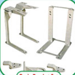
Basin Bracket Set