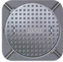
Manhole Cover Round