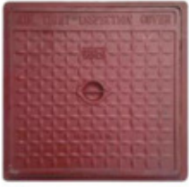
Manhole Cover Square