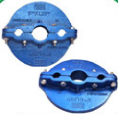
Ductile Iron Bore Cap